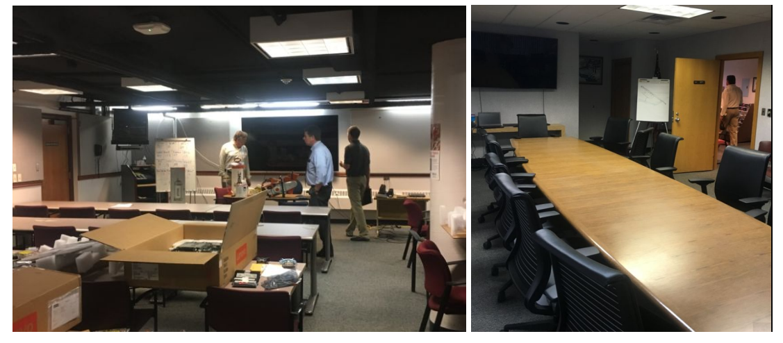
Union Road Meeting Room & Overflow Room

Main Street Meeting Room & Overflow Room